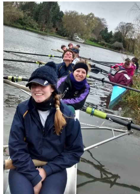
Windy conditions at Wallingford Head

Univ's senior women started the term strongly, with a large squad of keen rowers making trips to Godstow to train together. After a couple weeks of training, the racing began, with an excellent performance in IWL A, where our eight won the women's category with a sharp and focused row, and where our two fours came first and second, with only a 5 second difference in time between them!