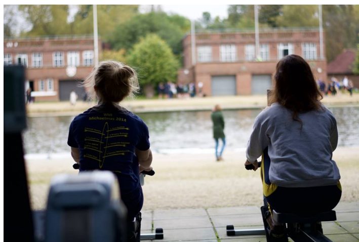
Erging at the UCBC Taster Day