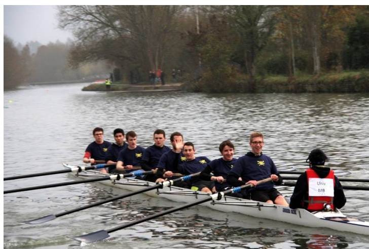
MNB in good spirits