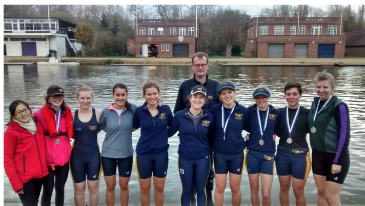
Senior Women win at Autumn Fours