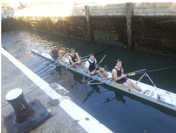
Senior men on the way to Godstow