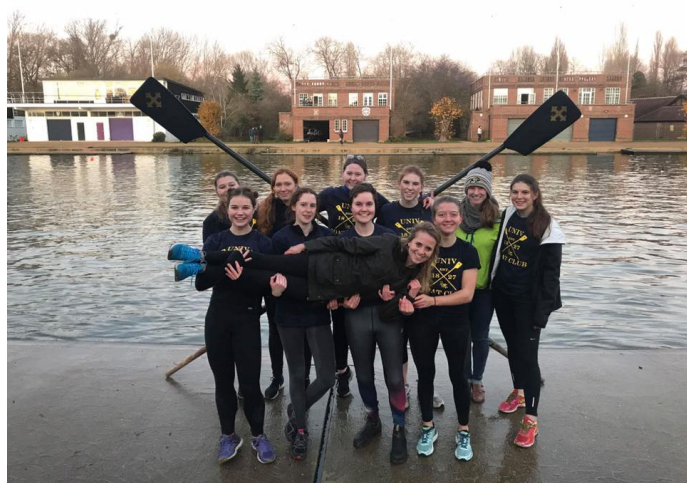
A proud WNA after bowing out of ChCh