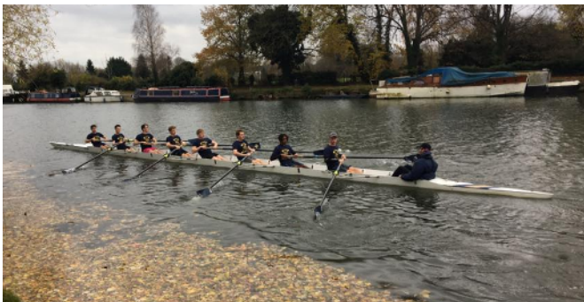
MNA in action

Christchurch was a great event for Univ. MNB beat (the eventual winners of the competition), Wolfson A in their very first race, but unfortunately lost to Brasenose A in the second round. MNA managed to reach Saturday of Christchurch beating Balliol MA, Merton MB and Mansfield MA