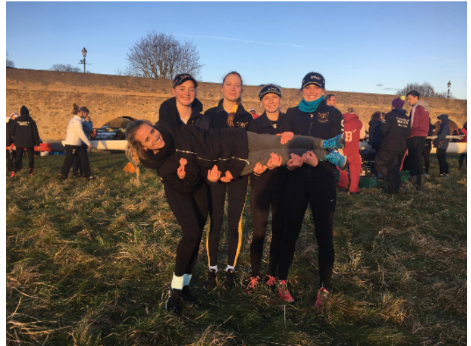
The UCBC W4+ at Wallingford Head

The final focus of the term was Wallingford Head, an external 4.5km head race. Our crew was composed of both extremely experienced rowers and complete novices, but came together admirably in the final weeks with unbelievable competency, willingness to learn and mental strength shown by the novice rower and cox. The four wrapped up warm to face the long hard wait in the December chill, and raced hard amongst very strong competition from other universities and clubs to place 7th in the Women's Four category.