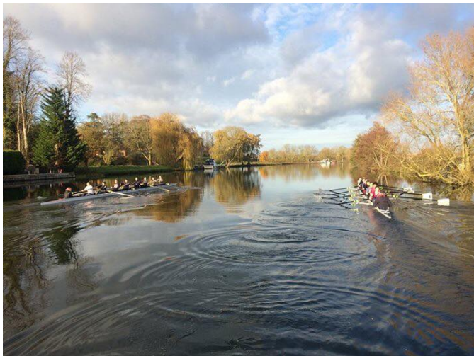
Univ women training at Wallingford with Oriel College

against a Merton A Four in the first round, but an unfortunate defeat in the second against a fast Jesus crew, all with a novice cox who very successfully rose to the challenges of regatta racing. As we got further into the term, our focus turned to developing and amalgamating the novice rowers into the squad with a long-term focus on Torpids next term. Weekend inter-squad eights sessions on the Isis saw rapid improvement across the board for seniors and novices alike, which put the latter in good standing for Nephthys and Christchurch regatta. Coupling these with crew breakfasts and pub trips ensured we all bonded well ahead of becoming one squad next term. A particular training highlight was taking an eight to Wallingford for a joint training session with Oriel Senior Women. The 20km continuous paddle in the beautiful sunshine, and the renewed focus training competitively alongside another boat gives were invaluable for the squad.