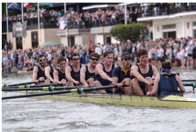
Univ M1 in Eights 2015

When the first day of Eights came we were in good shape and all looked forward to performing like we had in training. Unfortunately we were not able to do so. Never closing on Trinity more than a length, the Wolfson crew closed on us from the gut where we held them off up to the top of green banks.