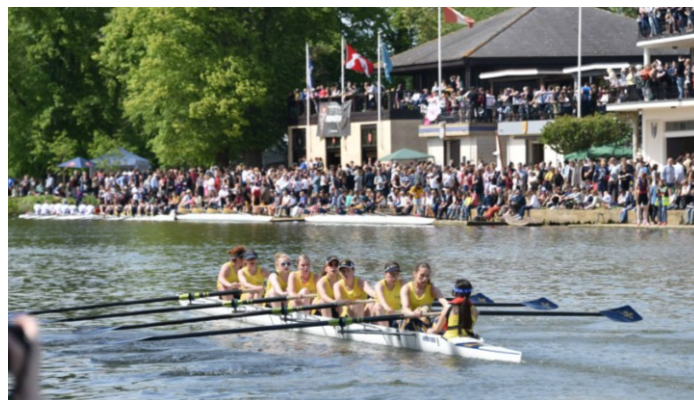
W2 at Summer Eights

W3 successfully qualified in rowing on and, like W2, had a tough position to defend at the top of women's division 6 with some competitive second boats behind them. On the first day the crew was bumped by Pembroke III early off the start, but this did nothing to dampen team spirit. W3 were proud to say that each day they made it slightly further down the course before being bumped, despite being chased by second boats (Mansfield II and Peter's II) on Thursday and Friday. On Saturday W3 made it past the cheering crowds at Univ boathouse to be bumped just before the finish, thus earning their spoons in style. This was looked on as a particularly unique achievement as one each of W3's two coxes and coaches achieved both blades and spoons in the same day. The crew's positivity did them credit, and despite dropping down in the rankings, the girls had a great experience of what for many of them was their first Summer VIIIs. As was overheard from one crew member at VIIIs dinner that evening, 'I wish they'd stop commiserating us for getting spoons - I'm actually quite proud of our achievement!'