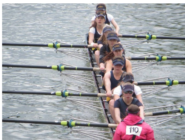
W1 at Bedford Regatta

Then, all thoughts turned to Eights, with seat racing and erg tests occurring and a final crew selected. We were all very nervous and excited coming up to Eights, but determined to use our growing fitness and the racing experience both from this term and last term. On the first day, we