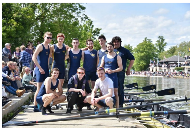
Above: M2 before racing on Saturday of Eights Below: M3 after bumping GTC