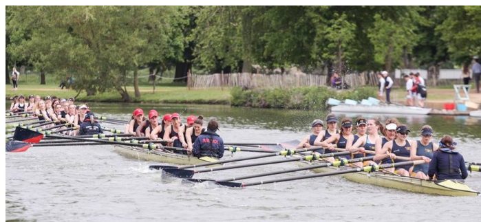
W1 bumping Balliol on Wednesday of Eights