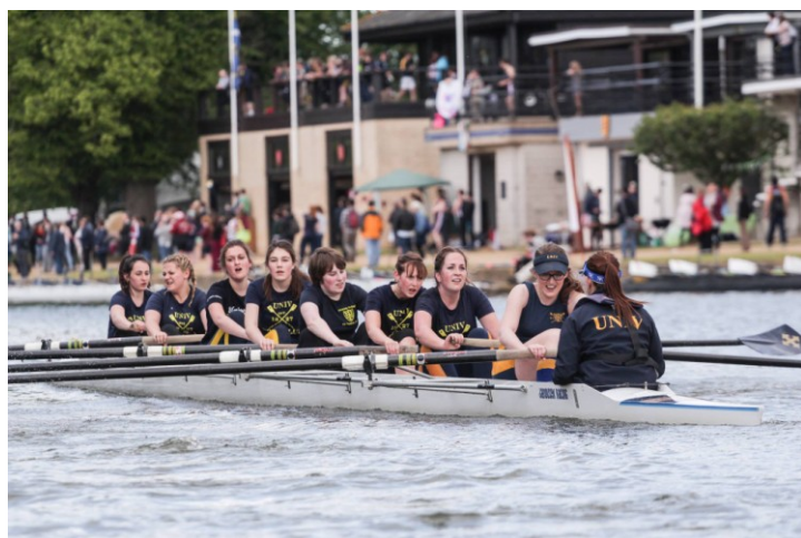
W3 in action

Thursday saw W2 chasing St John's II, and again they closed the gap to half a length before Worcester II unfortunately caught them. Friday saw W2 chased by Green Templeton, one of the fastest women's crews on the Isis. Weaker crews might have cracked under this pressure, but the crew put on brave faces, gave a strong start and made it nearly to the end of the bunglines before they were bumped. On Saturday the crew started at the bottom of division 3. With Linacre II putting pressure on them off the start, spectators on Donnington Bridge thought they were certain to be bumped, but the girls pulled off a great row-over ahead of Linacre II to defend their space in the women's senior divisions.