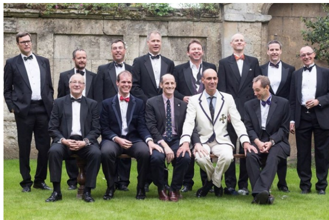
1990/1991 reunion at Summer Eights Dinner