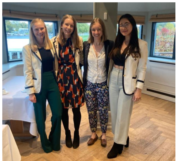
Left: The Martlet Club quad racing at Fours Head