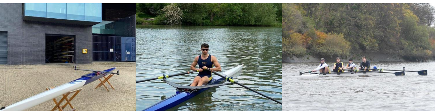
The new men's single and four.