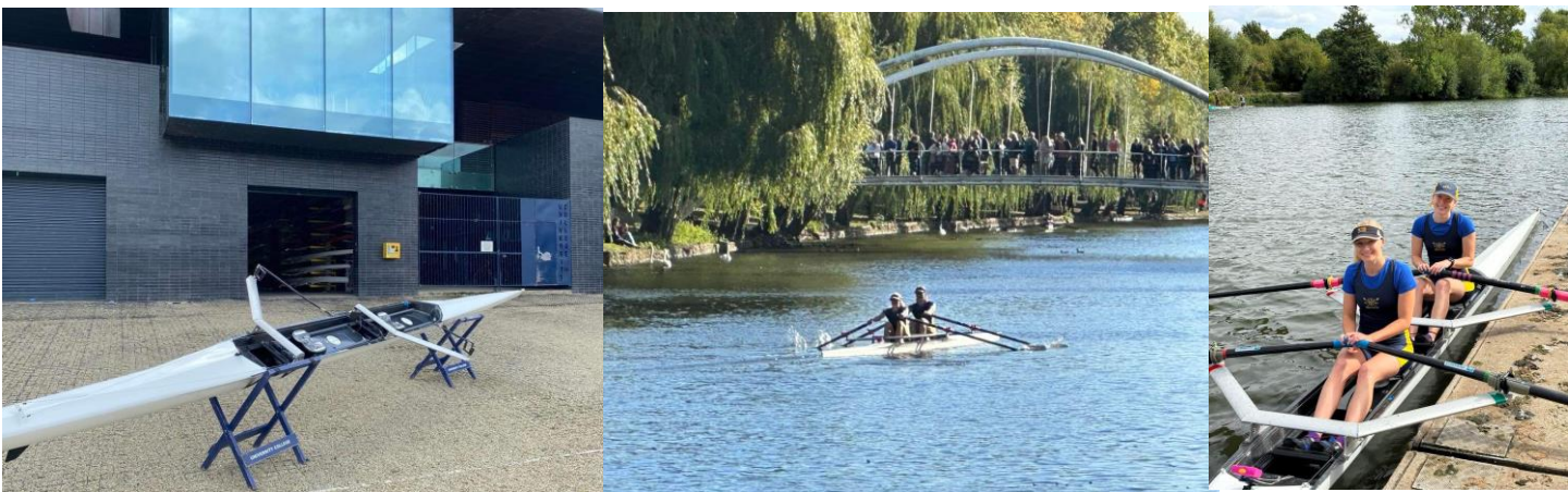
The new women's double.

In the past few years, UCBC has placed a great focus on external racing and small boats training. These two areas have been paramount to the development of a large squad of technically talented rowers, as is displayed by the successes described in the captains' reports. The limiting factor in a number of regattas has been shells to race in rather than lack of rowers, so over the past year we have been expanding our fleet! The most recent additions include a women's pair/double, a men's pair/double, a men's single, and a men's bowloader 4+, pictured below.