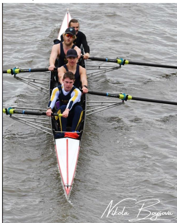
Univ men's A crew racing at Fours Head