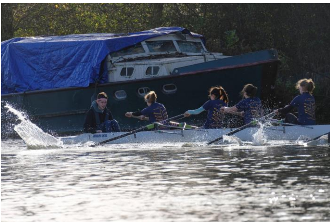
WNA racing at Michaelmas Novice Regatta